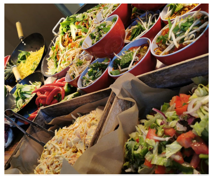
Did you know you can help yourself to free "leaves" with any hot