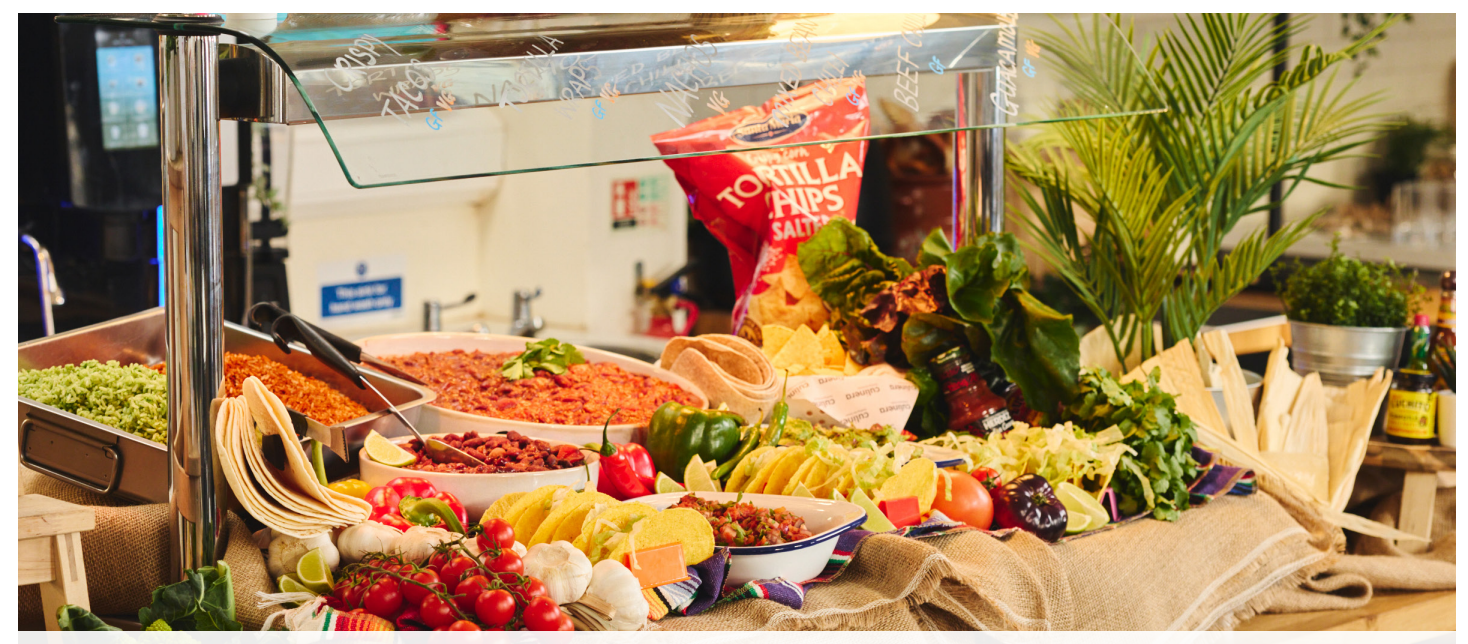
Culinera are famous for our take on the high street. We have at least 3 concepts available per week. This was a recent Mexican Food day.