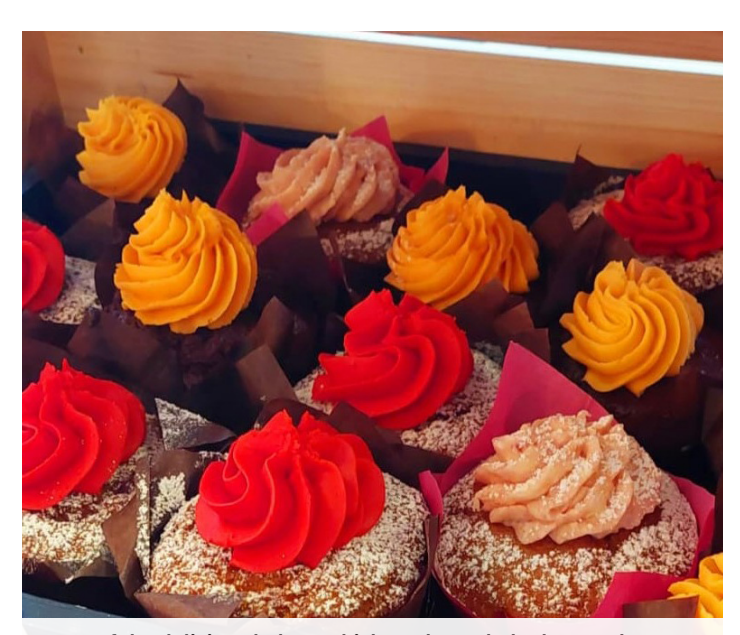
Some of the delicious bakes, which are home baked every day.