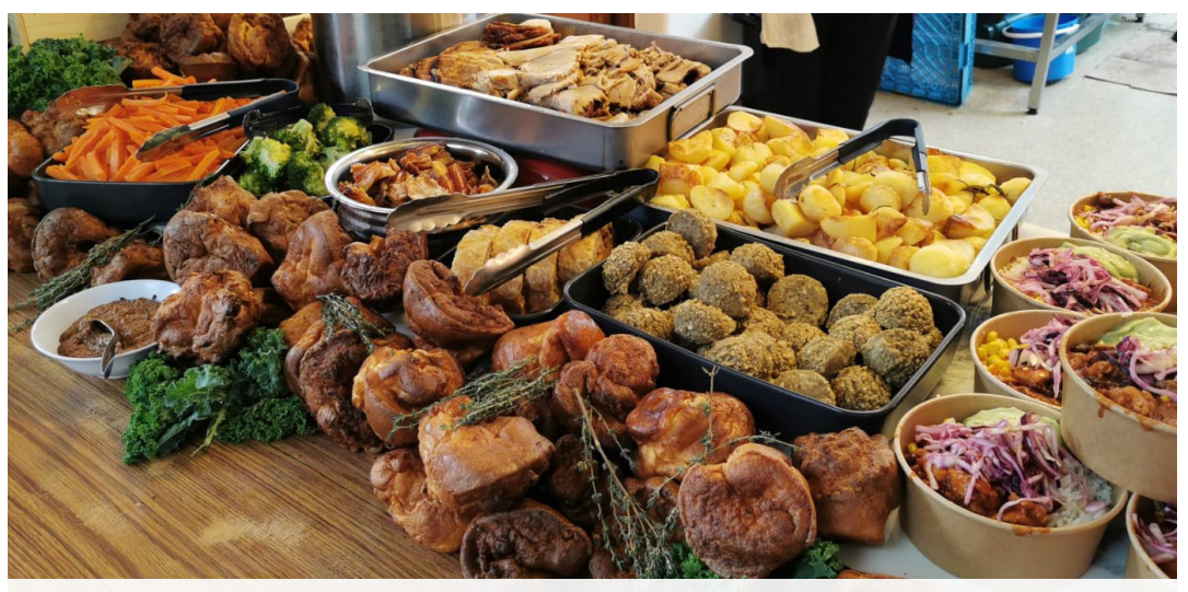
Come and try our famous Roast day, every Wednesday. Our Yorkshire Puddings are home made too!