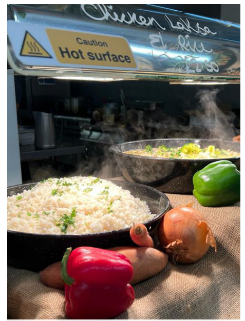
Chicken Laska a Wokamoma favourite!