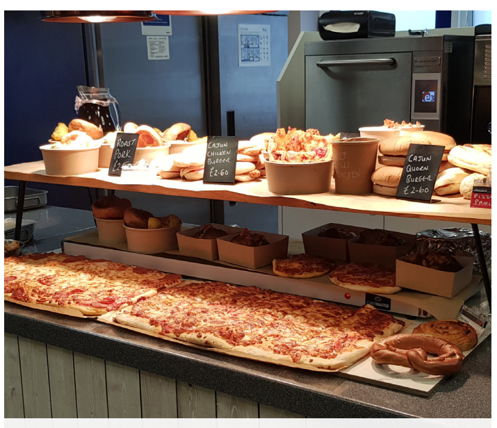
Sourdough pizza in the 6th form