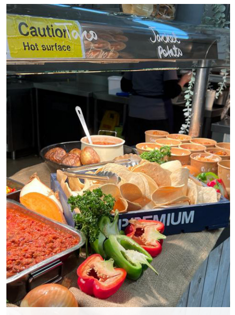
Low and slow cooked chilli-con-carne