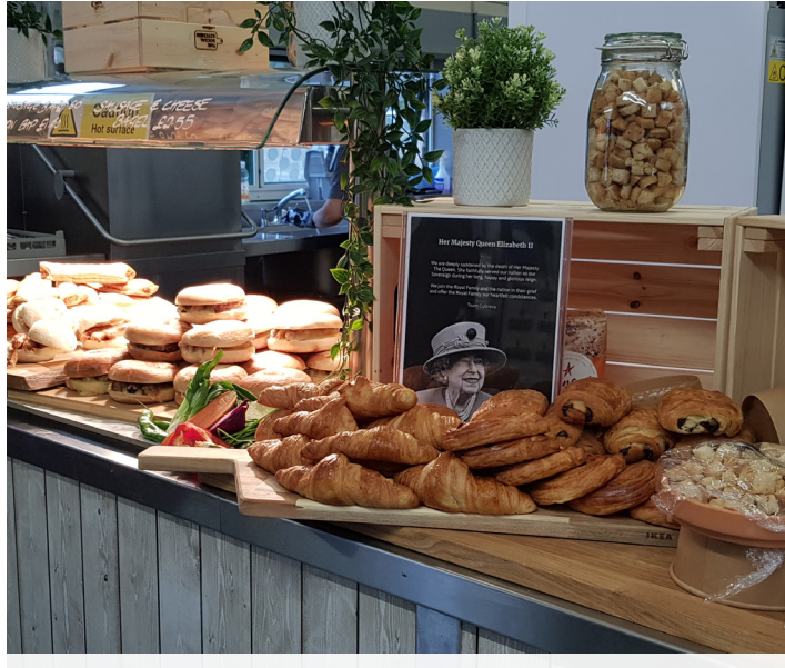
Breakfast pastries and bacon and sausage rolls